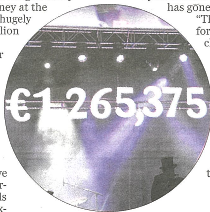
The all-important figure announced on Friday, the total raised from this year's Ring of Kerry Charity Cycle.

Now, minds have already turned to the 2019 cycle, with information on registration available from www.ringofkerrycycle.ie .