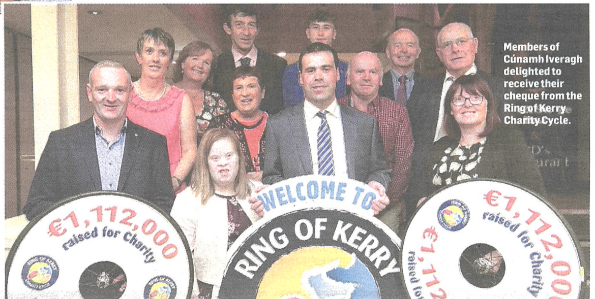
Members of Cúnagh Iveragh delighted to receive their cheque from the Ring of Kerry Charity Cycle.